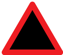
Feelings of hopelessness and pessimism