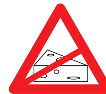
Appetite and weight loss