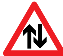
Changes in mood