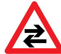
Difficulty making decisions