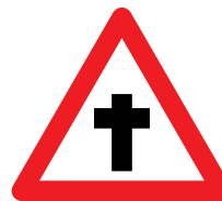
Thoughts of suicide